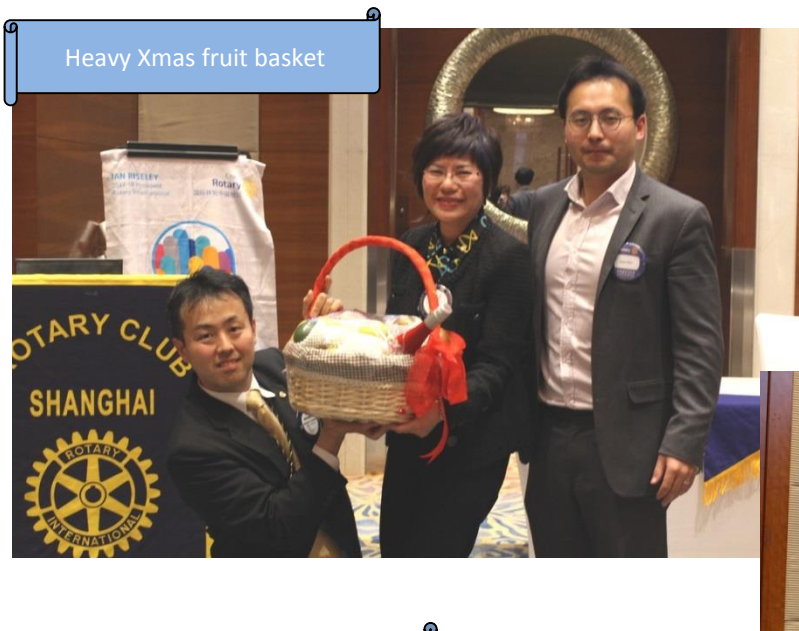
Heavy Xmas fruit basket